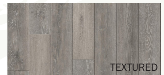
BOAT HOUSE 70006