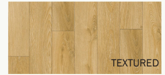
SHELTER COVE 70001